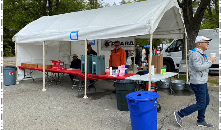
Fig. 2 — Another satisfied customer at the EFM likely to have another event later in the year.

questions answered, and socializing. I hope everyone enjoyed the day! Stay tuned as we're