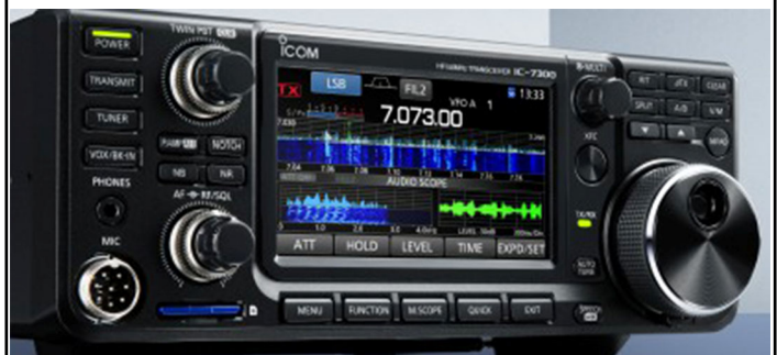
Fig. 1 — Icom IC-7300 Loaner Station

The Loaner station is an Icom IC-7300, which was a gift from the estate of a Silent Key club