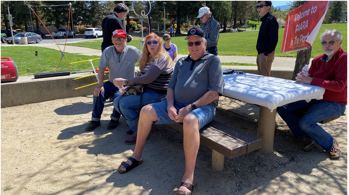
Fig. 3 — Discussions at PAARA in the Park

(Adventure Game — Continued from page 1)