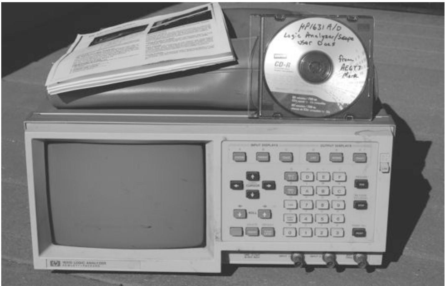
HP 1631D, Logic Analyzer and Oscilloscope to be auctioned at the May meeting.

The HP 1631D will be on display at the April meeting and up for auction at the May meeting.